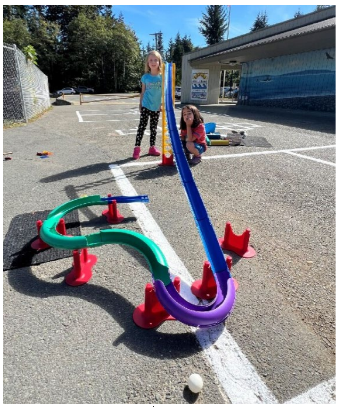
K/1 Class Fun