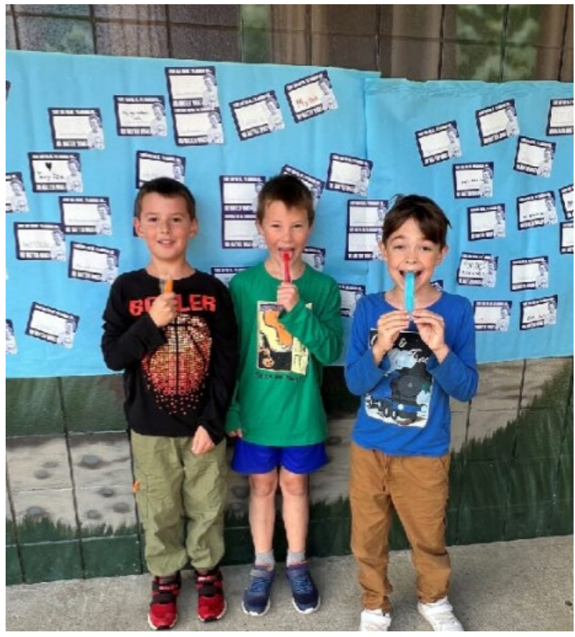
Freezes after Run