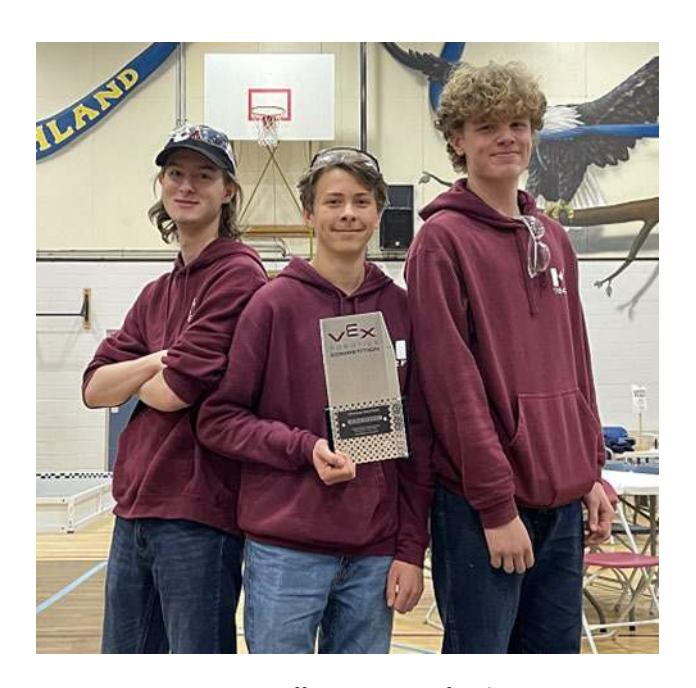
Team-F: Excellence Award Winners