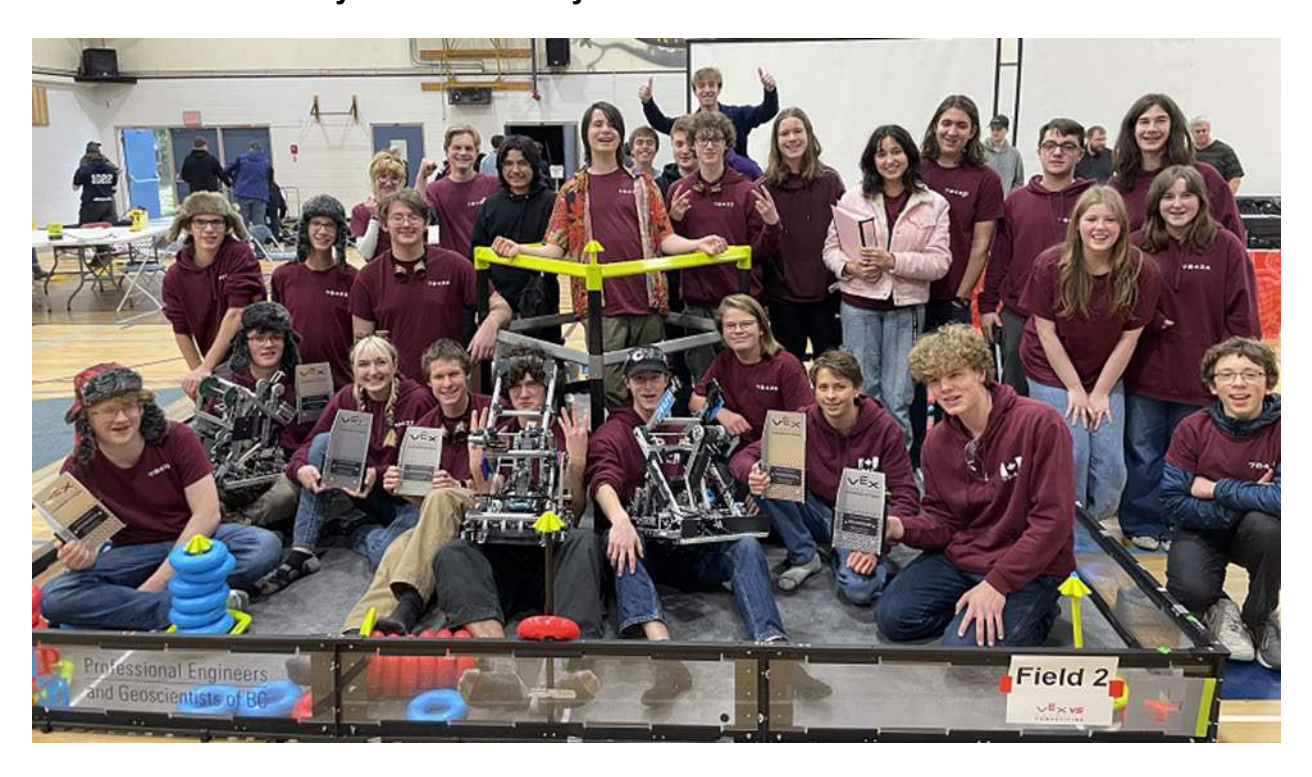
Robotics 71 team photo